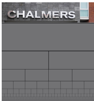
Figure 1: The Dark Chambers of Chalmers...

You are on your way to the final competition of the Swedish Olympiad in Informatics, which is hosted at Chalmers Technical University. However, you have gotten lost in the university basement. Your sense of direction is not great, and what makes matters worse is the very strange design of the basement.