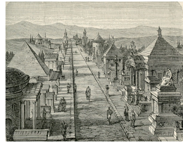
Ancient Romans, promenading on Via Appia. Public Domain by Strafforello Gustavo on Wikimedia Commons

It is the 25th of August, 225 BCE. You are in charge of the annual road trip of the Backtracking-Averse Promenaders Club in Rome. Alas, you get homesick easily and would much rather stay at home. Therefore, your goal is to keep the road trip as short as possible. Traditionally, the road trip cannot backtrack along a road it just used – your friends would start to complain. Specifically, if you travel directly from site x to site y , you cannot immediately go back from y to x along the same road.