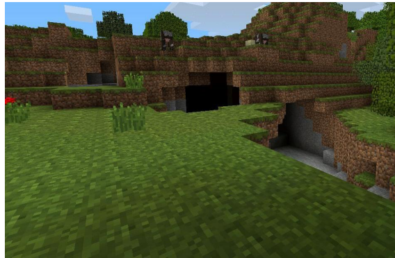
Figure 1: A typical world in Minecraft.

Have you ever played the video game Minecraft? This game has been one of the world's most popular game in recent years. The world of Minecraft is made up of lots of 1 \times 1 \times 1 blocks in a 3D map. Blocks are the basic units of structure in Minecraft, there are many types of blocks. A block can either be a clay, dirt, water, wood, air, ... or even a building material such as brick or concrete in this game.